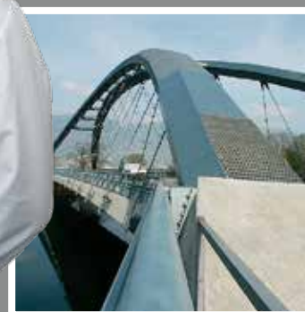
Arch Bridge, Grenchen