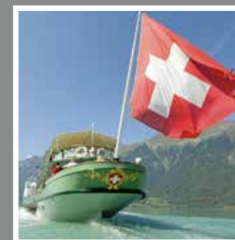
corrosion protection in shipbuilding