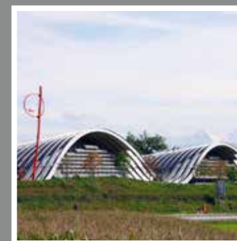
Paul Klee Center, Berne